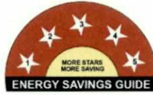
Star Rating Logo

Upon request from various permittees and with the interest of promoting the star label, BEE hereby allows the permittees to use only "Star Rating Logo".