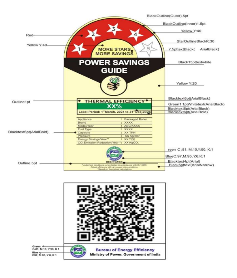
Figure 2 Color Scheme for the Label

Hue (H)-150° Saturation(S):10% Brightness (B):67% Luminance or lightness (L):61, chromatic components -a: 53 b: 32 Red(R):0 Green (G):170 Blue (B):87 Cyan(C):81% Magenta (M):10% Yellow(Y):90% Black (K):1% Web color code - #00AA56;